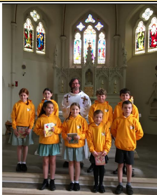
Newly Commissioned Chaplains

We hope that all of our children and families have a restful half term - hopefully the sun will finally shine! We look forward to seeing you in school on Tuesday 8th June (Monday 7th June is a training day for staff)